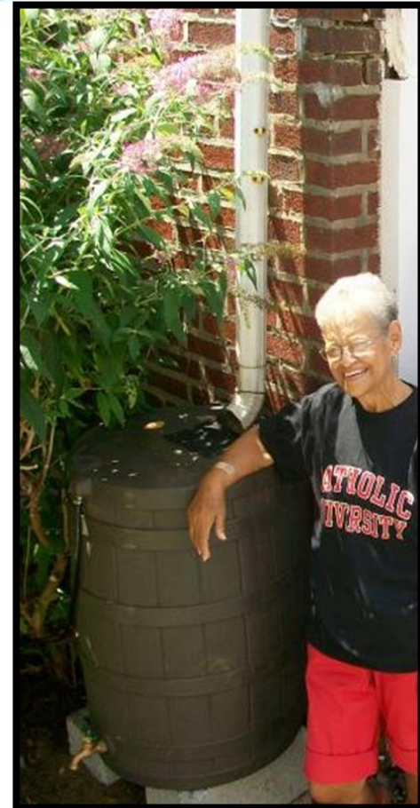
Urban Agriculture & Clean Water in the Chesapeake Bay